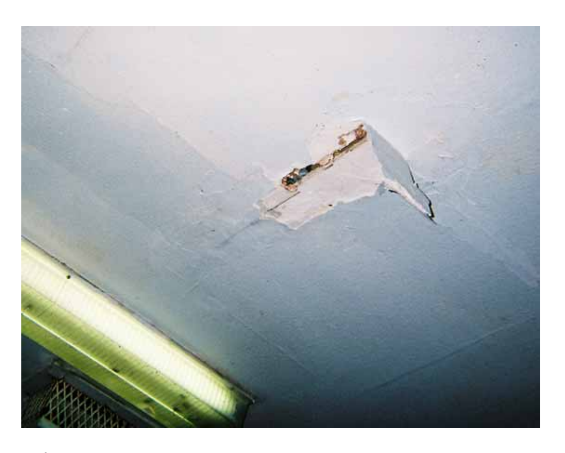
Ceiling in disrepair (above)