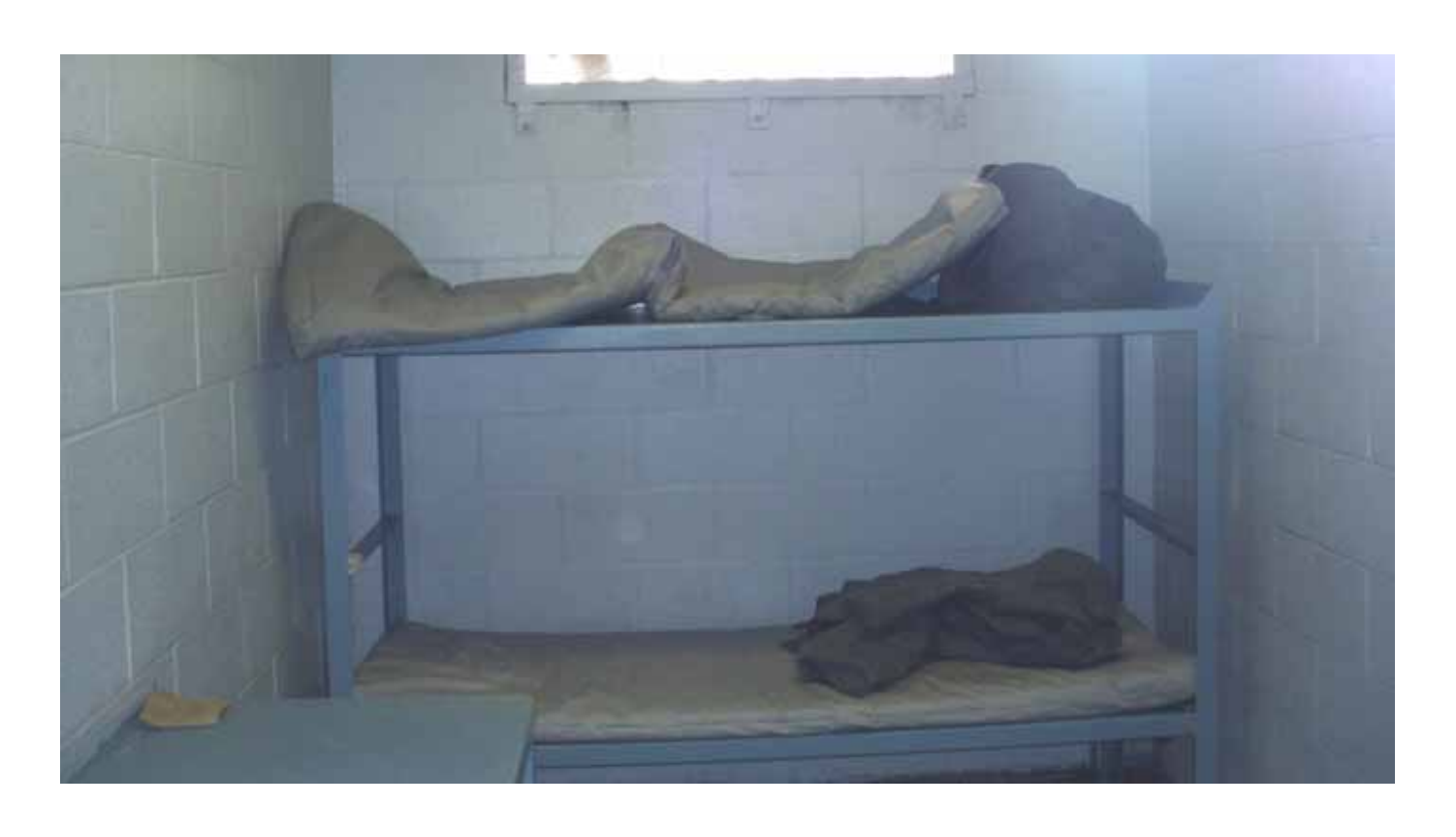
Youth sleeping area showing holes in mattresses and no sheets