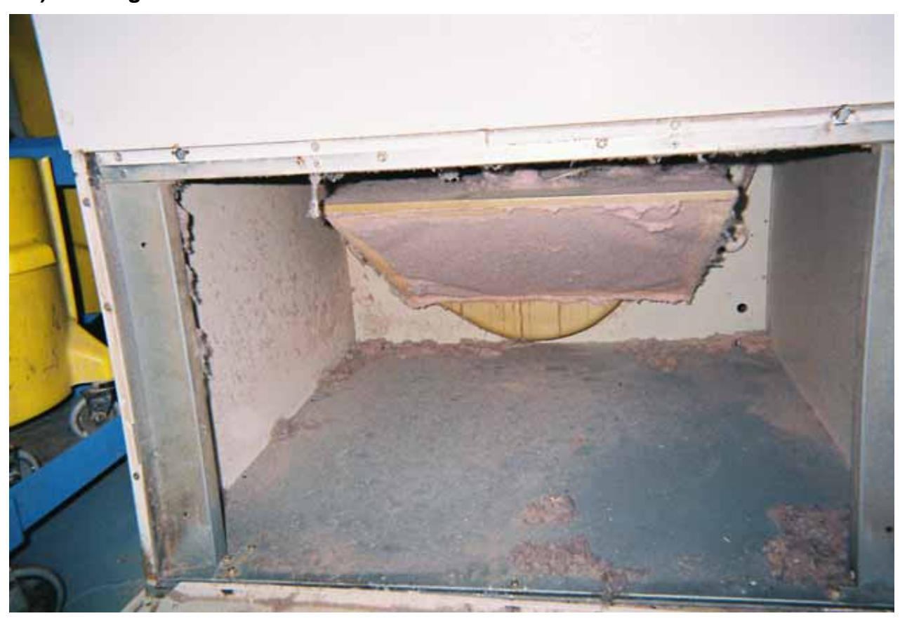
Clogged lint-trap under the only operational dryer on campus (for nearly 200 youth) creating another fire hazard

Youth mattresses without fire protecting covers/ exposed bedding material