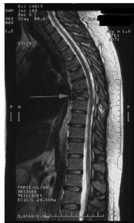
Figure 2. Magnetic resonance imaging scan of the thoracic spine demonstrating acute T7 compression fracture without spinal canal compromise (arrow denotes fracture).

The current TASER works by incapacitating one's ability to maintain volitional control of the body by causing electro-physical, involuntary contraction of skel-