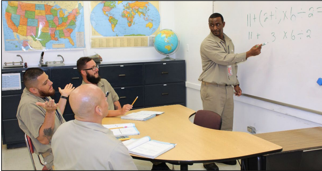
EDUCATION. BOP inmates participate in a GED program.