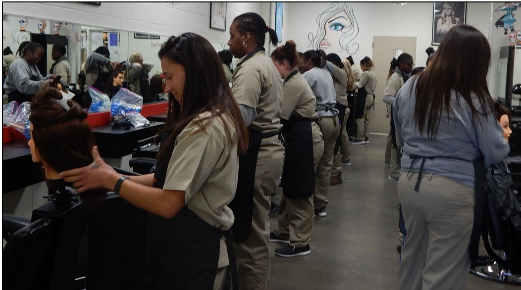
WORK PROGRAMS. Inmates participate in a cosmetology vocational program at FPC Bryan.

The approved FY 2020 budget for DOJ from both the House and the Senate provides seventy-five million dollars ($75 million) for FSA implementation activities. 17