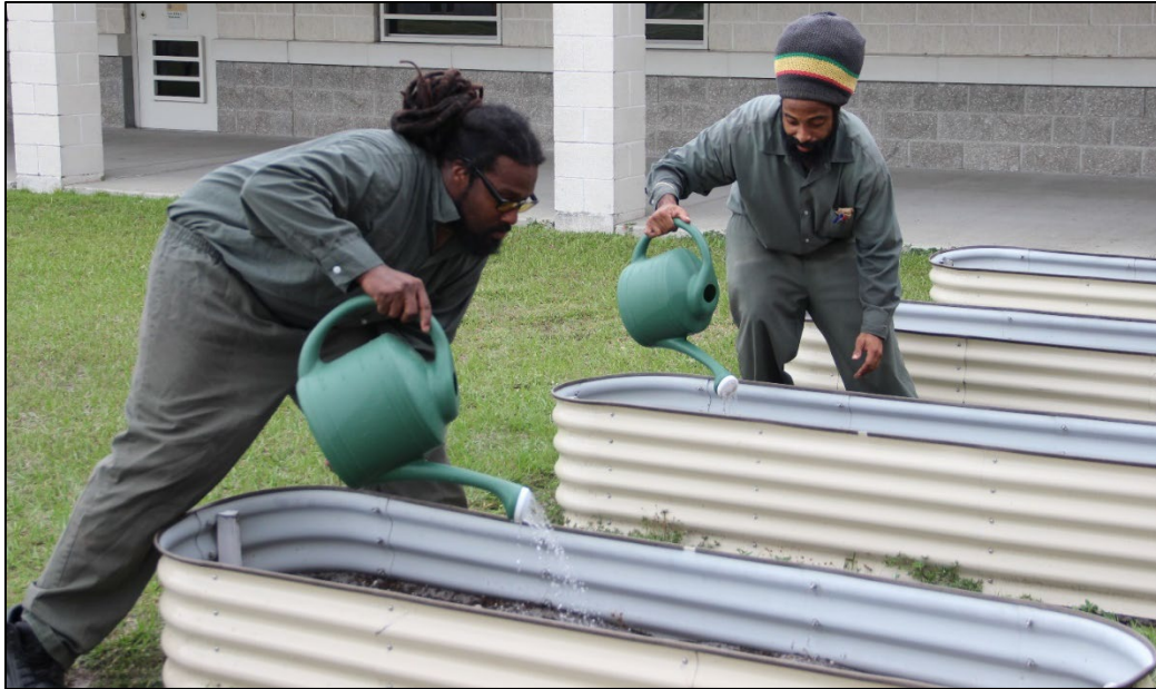
WORK PROGRAMS. Students apply the concepts of horticulture through hands-on learning at FCC Coleman in Sumter County, FL.

BOP has already begun expanding programs and hiring staff to deliver the programs. While the FSA did not come with appropriated funds in FY 2019, the Deputy Attorney General announced in July 2019 that BOP had taken the initiative to adjust funding within its budget to cover a variety of targeted FSA activities, including: