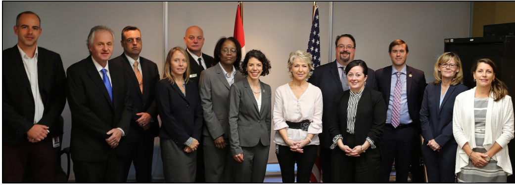
ENGAGEMENT. The DOJ delegation poses for a photo with CSC staff.