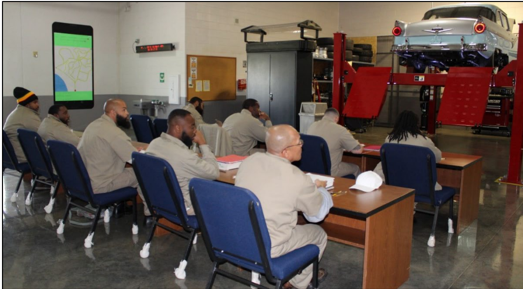
WORK PROGRAMS. Inmates learn how to properly perform a four-wheel vehicle wheel alignment as part of an automotive chassis vocational program at FCI Bennettsville.

The Department tested the updated version of PATTERN to ensure that individuals could successfully move from a higher to a lower risk score. The examples in Attachment A show how different types of inmates can use the dynamic factors in the updated PATTERN to lower their risk score and how a motivated inmate's risk score will improve compared to an unmotivated inmate who does not thoroughly complete evidence-based recidivism reduction programs.