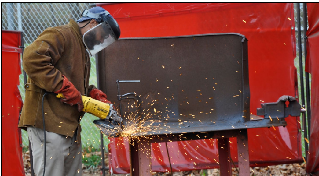
WORK PROGRAMS. A vocational student grinds a test plate that was welded in the Gas Metal Arc Welding (MIG) Process at FCI Morgantown.

BOP shares the stakeholders' concerns about program availability and is preparing to meet an anticipated increased demand as inmates will be eligible to receive incentives for completing programs.