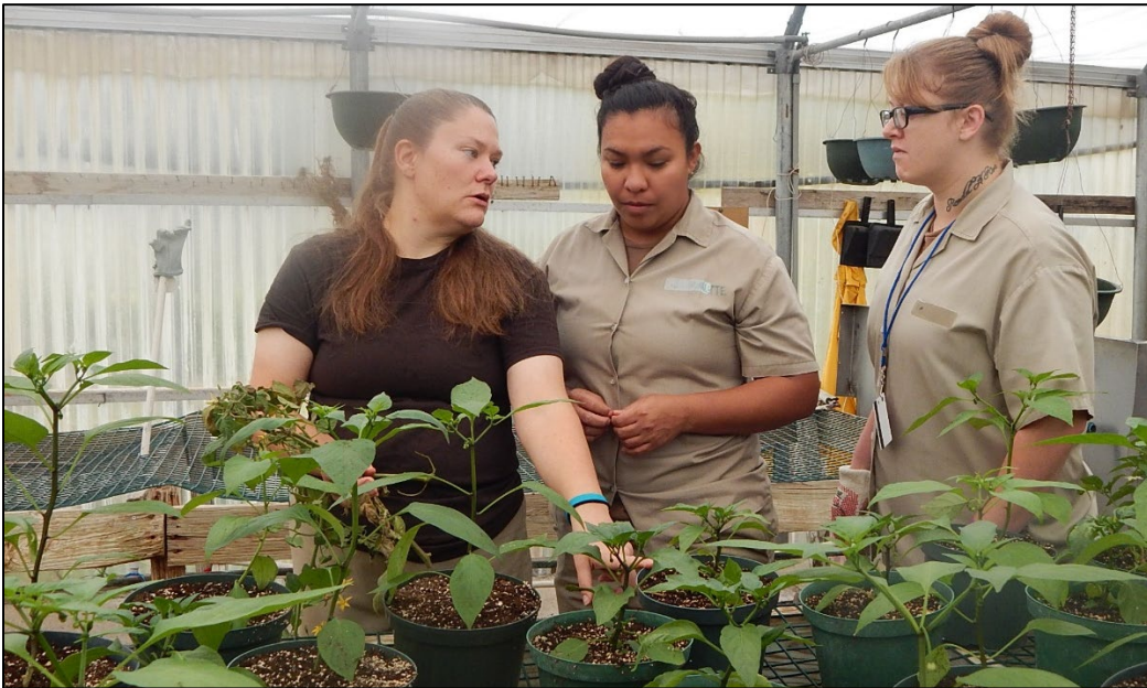
WORK PROGRAMS. Inmates participate in a horticulture vocational program at FPC Bryan.